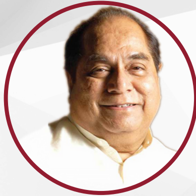
Padmashree Dr. D. Y. Patil Founder , DY Patil Group

The former Governor of Bihar, Tripura & West Bengal, and recipient of the prestigious Padmashree Award, Dr. D. Y. Patil is a well-known educationist and philanthropist.